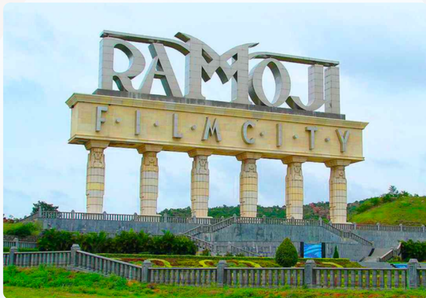
Ramoji Film City

This majestic fortification is a testament to Hyderabad's medieval grandeur. Perched on a hill, it provides panoramic views of the city and hosts a captivating sound and light show in the evenings.