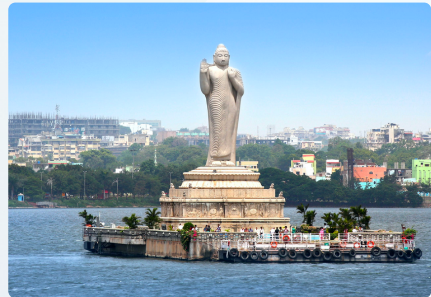
Hussain Sagar Lake

Holding the title of the world's largest film studio complex, this wonderland offers entertainment for all ages. From enchanting film sets to thrilling rides and shows, it's a must-visit for movie buffs and families alike.