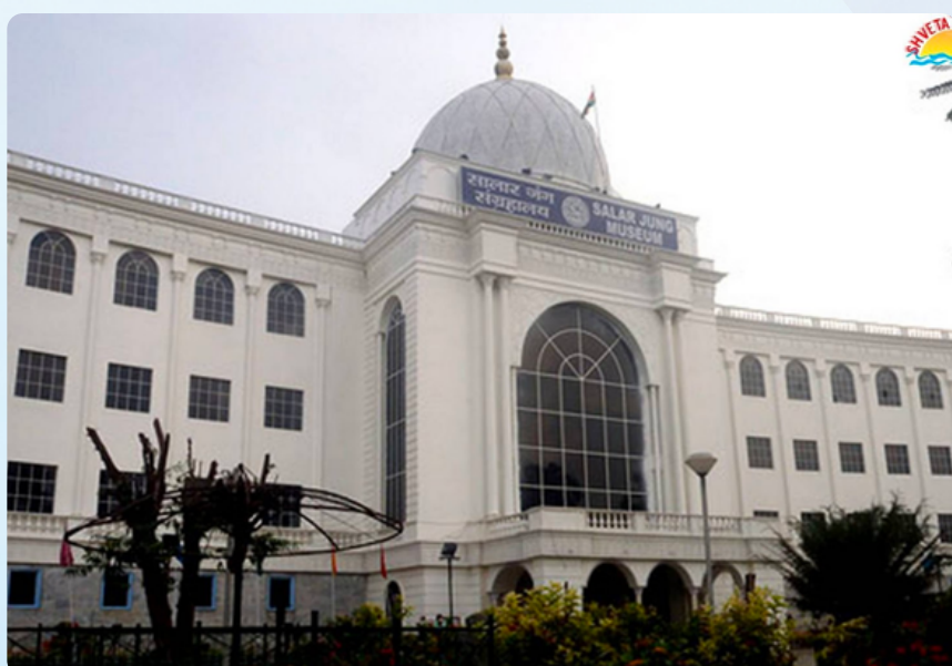
Salar Jung Museum

A tranquil oasis in the city, known for its monolithic Buddha statue situated in the middle of the lake. The surrounding parks and water sports make it a perfect spot for relaxation and leisure.